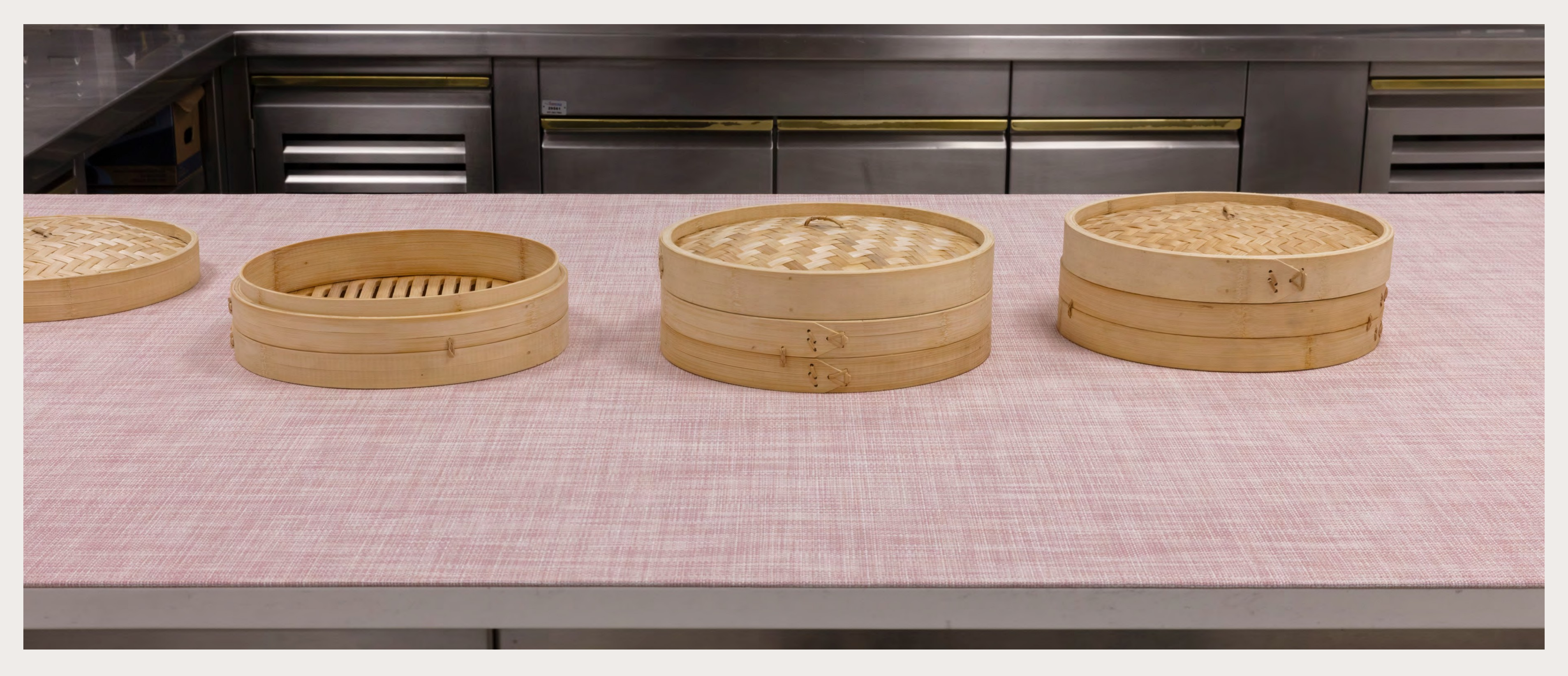
BLUSH, Mini Basketweave Worktop The Grill, New York, NY.