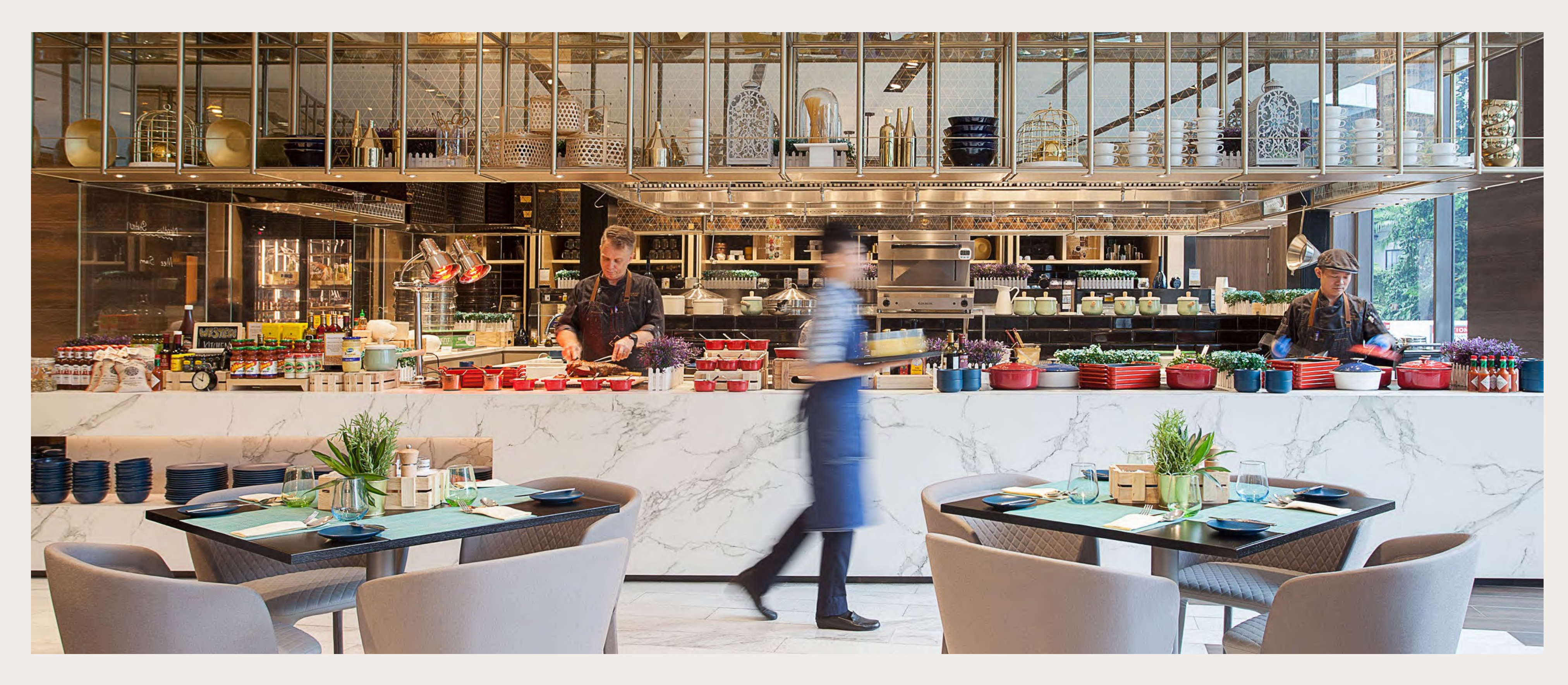
Food Exchange Restaurant, Novotel Singapore on Stevens Hotel