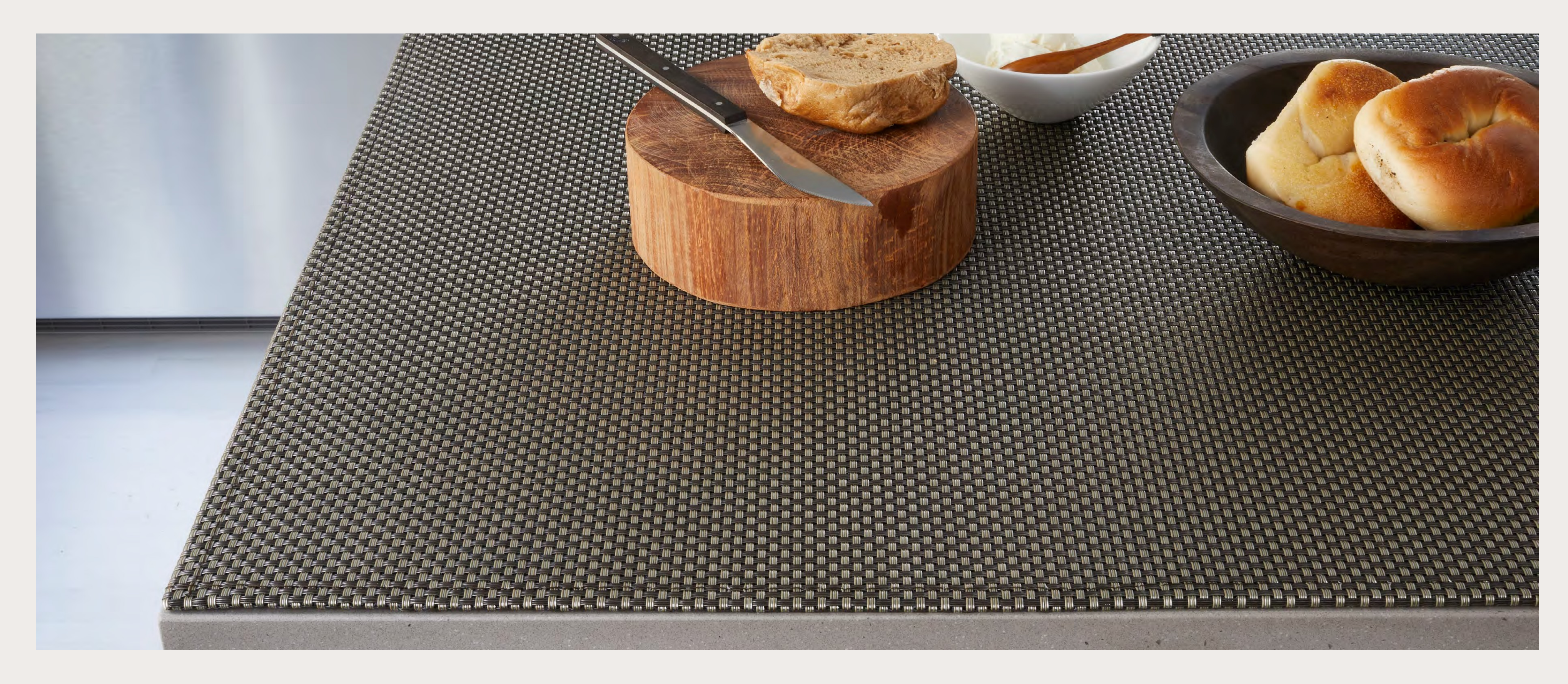
TITANIUM, Basketweave Corporate kitchen.