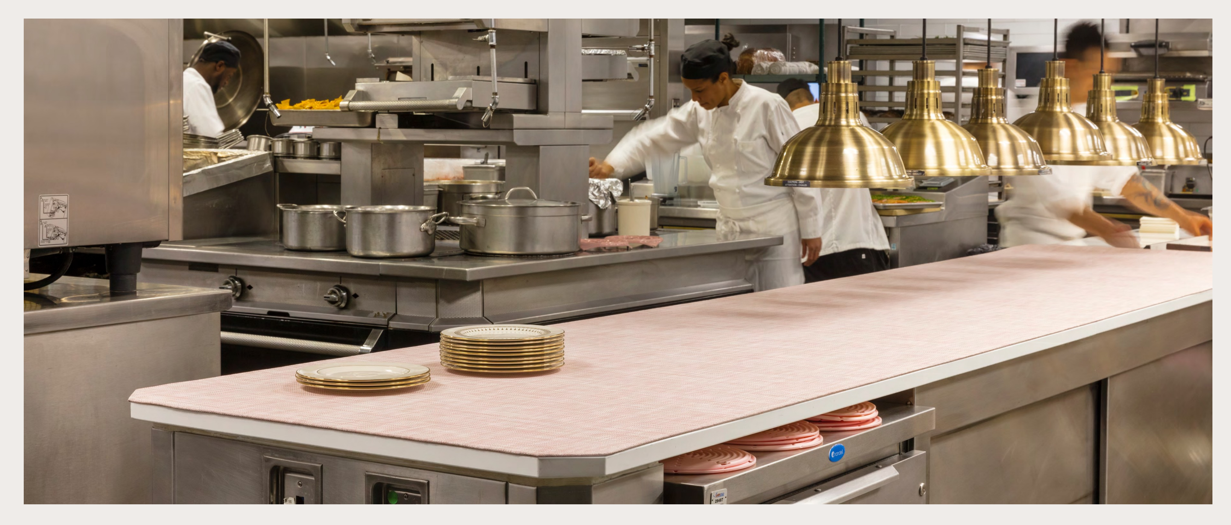
BLUSH, Mini Basketweave Worktop The Grill, New York, NY.